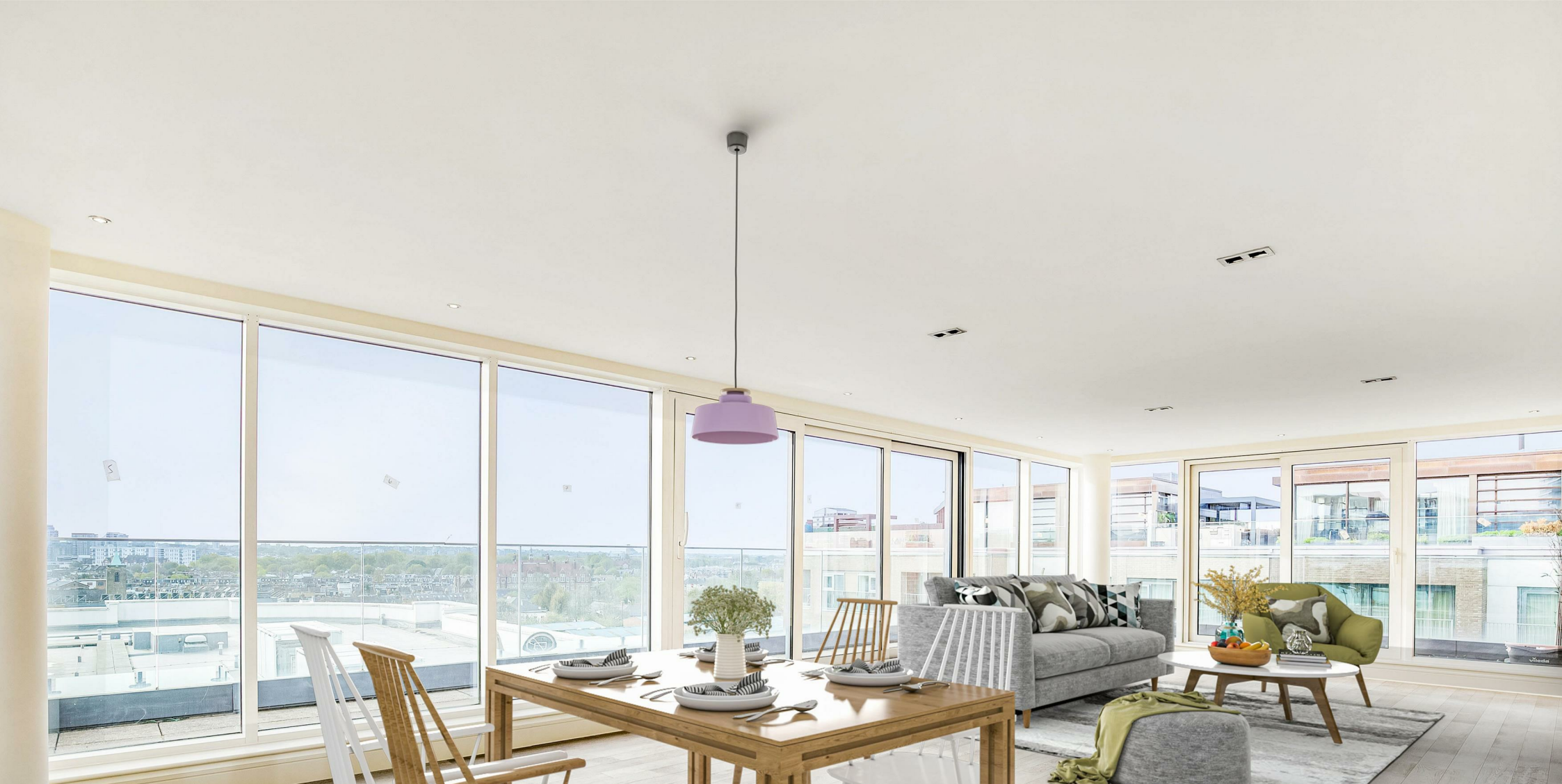
Compass House, Chelsea Creek Fulham SW6